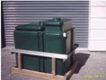
Steel support band

Additional toilets (pump and fittings for). Maximum of three toilets.